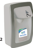
Gray w/gray DML07WH32