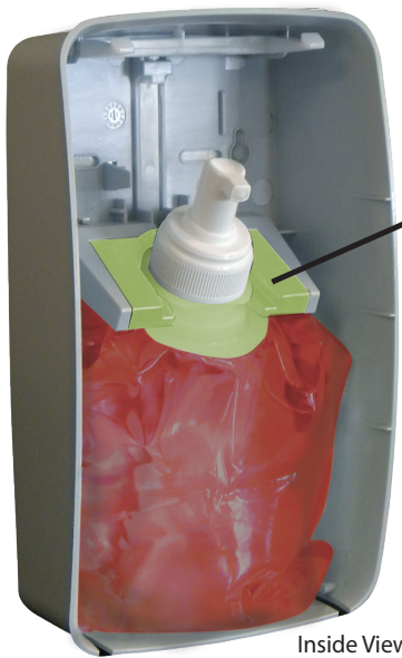
Olive Green Hanger