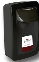
Black w/black SS007BK31